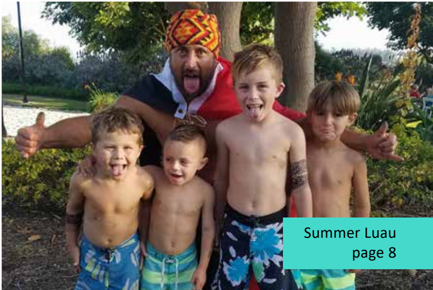
Summer Luau page 8