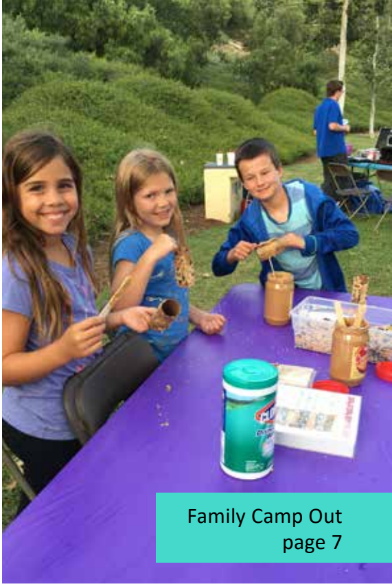
Family Camp Out page 7

This time of year the bees start buzzing about so we can have fruits, vegetables and flowers year after year.